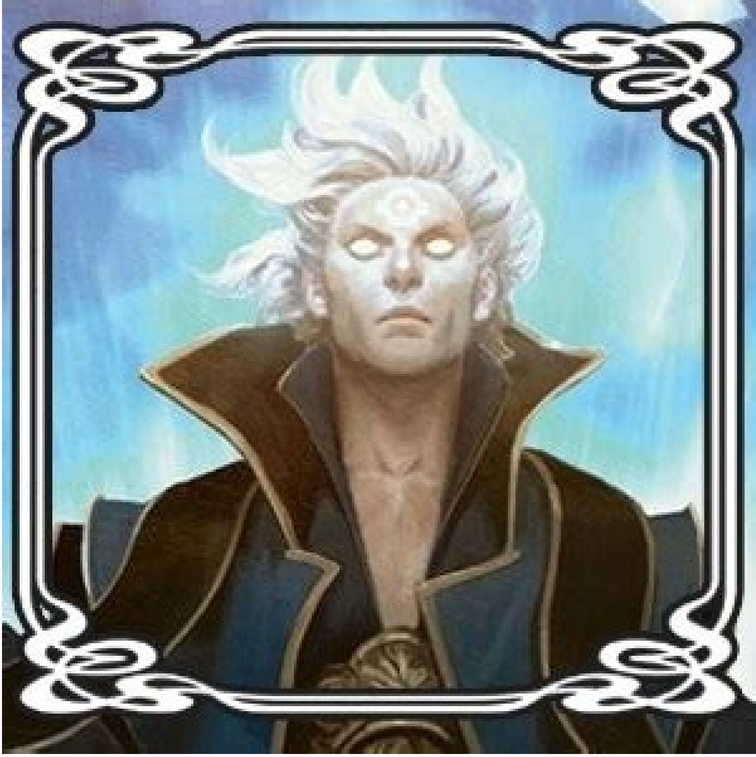
D&d 3.5 fly spell. What is the best spell in d&d.